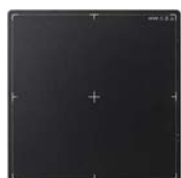
17HQ901G Oxide TFT Wired / Wireless