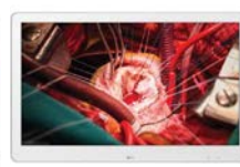
27HK510S 27-inch (16 : 9) | IPS Full HD (1,920 x 1,080)