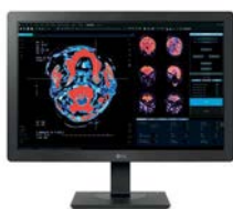
24HR513C-B 24-inch (16 : 10) | IPS 2MP (1,920 x 1,200)