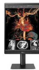
21HQ513D-S 21.3-inch (3 : 4) | IPS 3MP (1,536 x 2,048)