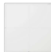
17HK700G-W a-Si TFT Wired

Copyright 2026 ©LG Electronics USA, Inc. All rights reserved. LG and the LG logo are registered trademarks of LG Corp. All other products and brand names are trademarks or registered trademarks of their respective companies. Designs, features, and specifications are subject to change without notice. All screen images are simulated for illustrative purposes only. FLY_MEDICAL DEVICES QUICK GUIDE