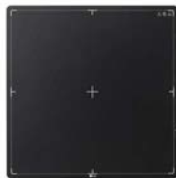
17HQ701G a-Si TFT Wired / Wireless