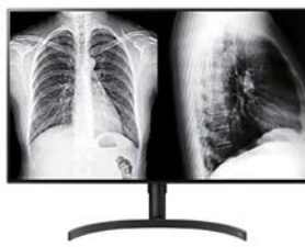
32HL512D-B 31.5-inch (16 : 9) | IPS 8MP (3,840 x 2,160)