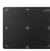
10HQ701G a-Si TFT Wired / Wireless