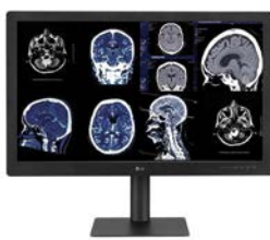
32HQ713D-B 31.5-inch (16 : 9) | IPS Black 8MP (3,840 x 2,160)