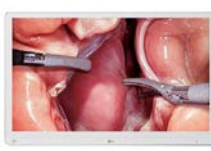
32HS714S 31.5-inch (16 : 9) | IPS 3G-SDI 4K (3,840 x 2,160)