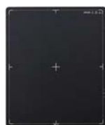
14HQ901G Oxide TFT Wired / Wireless