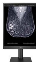
21HQ613D-B 21.3-inch (4 : 5) | IPS 5MP (2,048 x 2,560)