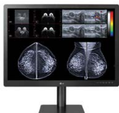
31HN713D-B 31-inch (3 : 2) | IPS 12MP (4,200 x 2,800)