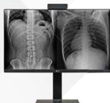
27HS713C 27-inch (16 : 9) | IPS 8MP (3,840 x 2,160)