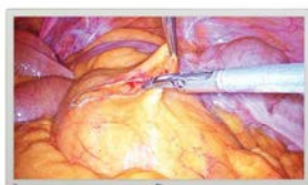
55MH5K 55-inch (16 : 9) | IPS 4K (3,840 x 2,160)