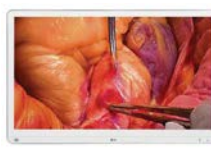
27HS714S 27-inch (16 : 9) | IPS Mini-LED, 12G-SDI 4K (3,840 x 2,160)