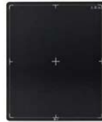
14HQ701G a-Si TFT Wired / Wireless