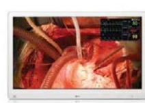
27HQ710S 27-inch (16 : 9) | VA Mini-LED, 12G-SDI 4K (3,840 x 2,160)