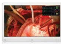
32HR734S 31.5-inch (16 : 9) | IPS Mini-LED, 12G-SDI 4K (3,840 x 2,160)