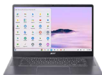
Acer Chromebook Plus 515