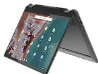
Lenovo Flex 5i Chromebook

Unlock all the built-in capabilities of ChromeOS for your business , with ChromeOS Enterprise devices or purchase ChromeOS device management and attach it to your existing devices.