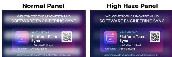
screen images simulated

Ensure a clear and visible image in high ambient light areas with a high haze anti-glare panel. The PN-E series panels are designed to scatter incidental light that would otherwise take away from messaging shown on the display. This allows your message to be clear and visible in areas where ambient light would usually take away from what really matters most - your content.