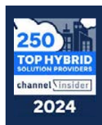
Channel Insider Hybrid Solution Provider 250-2024