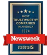
Most Trustworthy Companies in America 2024