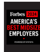
Forbes America's Best Midsize Employers list 2024