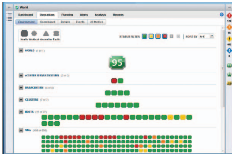
Figure 4: The overall environment is scored, and data centers, clusters, hosts, and VMs are color-coded based on their relative health.