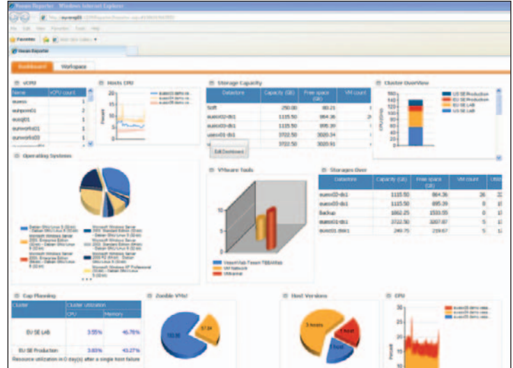
Figure 3: Dashboard-like graphics help summarize the environment making further analysis easier.