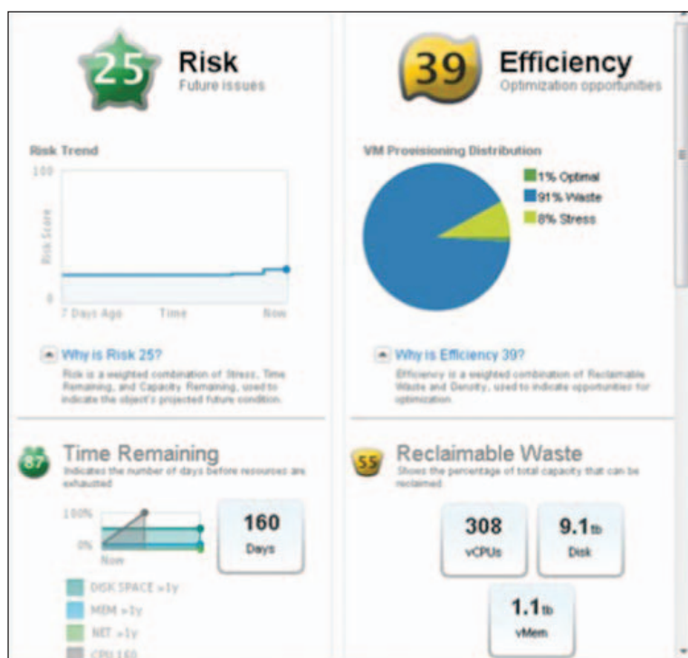
Figure 5: Capacity is rated for both risk and efficiency; opportunities for reclaimable waste are identified.